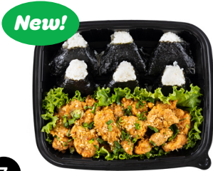
Garlic Chicken & Triangle Musubi Pā'ina Platter (Serves 10) $42.99 | 290 CAL per serving