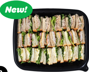
Sandwich Pā'ina Platter (Serves 10) $37.99 | 230 CAL per serving