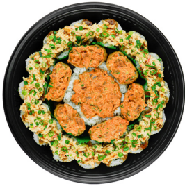
Volcano Sushi Platter (21 PCS) $34.99 | 270 CAL per serving