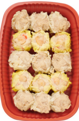
'Ohana Shrimp & Pork Hash (15 PCS) $16.99 | 150 CAL per serving