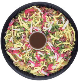
Local Fried Saimin Platter (Serves 10-12) $33.99 | 200 CAL per serving

The listed calorie content represents the recommended serving size for a single portion.