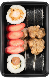
'Ohana Musubi Roll Pack (Serves 4-6) $14.99 | 220 CAL per serving