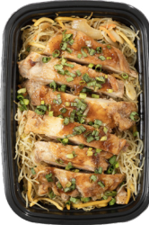
'Ohana Chicken Adobo & Pancit (Serves 4-6) $15.99 | 110 CAL per serving