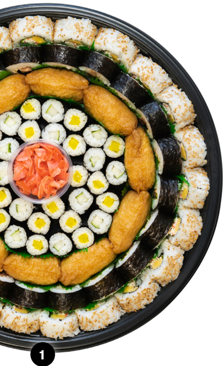
Grand Sushi Platter (82 PCS) $49.99 | 260 CAL per serving