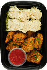
'Ohana Pupu Mix (Serves 4-6) $15.99 | 310 CAL per serving