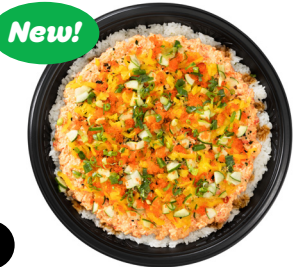
Dynamite Pan Sushi Platter (Serves 10-12) $33.99 | 290 CAL per serving