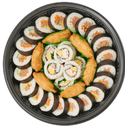
Deluxe Sushi Platter (34 PCS) $32.99 | 170 CAL per serving