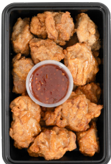
'Ohana Chicken Bites (Serves 4-6) $17.99 | 140 CAL per serving