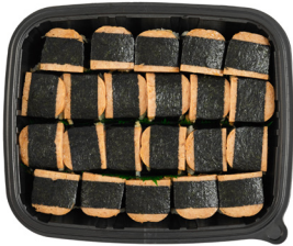
SPAM® Musubi Pā'ina Platter (22 PCS) $30.99 | 270 CAL per serving

Be sure to follow the heating instructions prior to serving. If you would like your platters heated for pickup, please let the store team know when placing the order.