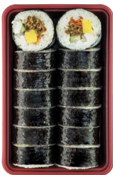
'Ohana Shoyu Tuna Maki (16 PCS) $15.99 | 170 CAL per serving