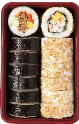
'Ohana Tuna Maki & Seafood Salad Maki (16 PCS) $15.99 | 280 CAL per serving